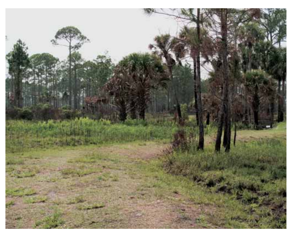
A view of the landscape at Amistad