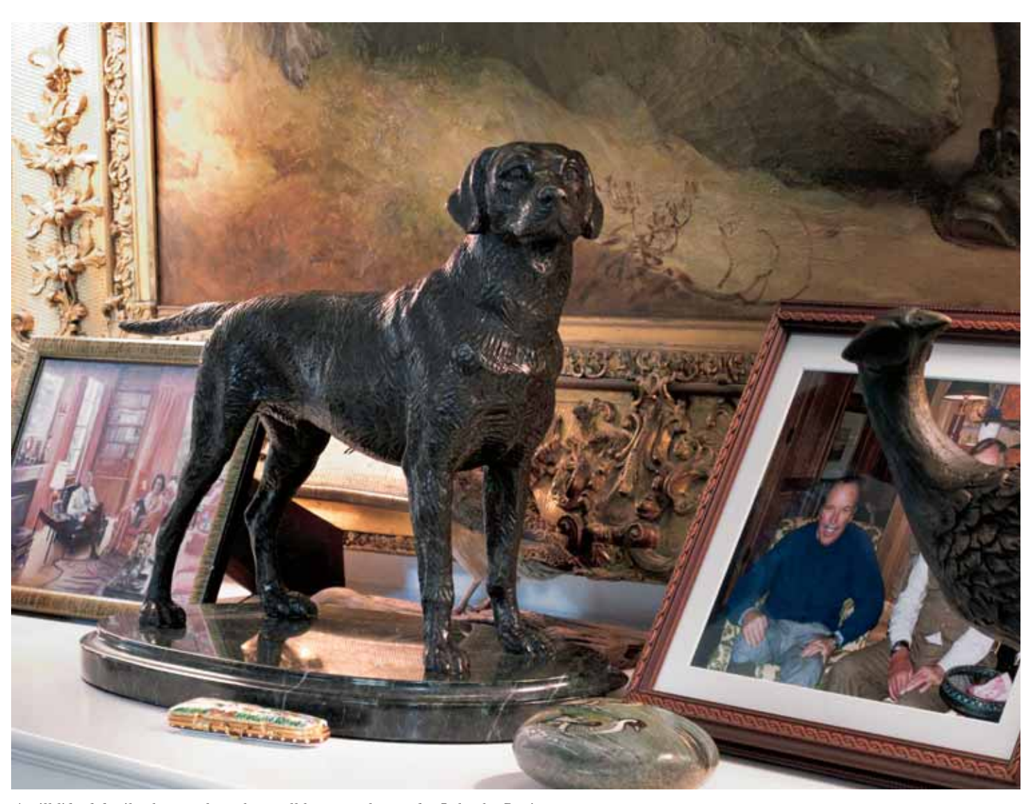
A still life of family photographs and a small bronze sculpture of a Labrador Retriever

anyone." Mambo was more of a one-person dog, and he could rise to the occasion when required. "One day our dog walker was exercising Mambo in New York's Central Park. All of a sudden, two young kids appeared, knocking her to the ground and running off with her purse. Well, Mambo immediately went after the thieves. He not only got the purse back but he also stood over it and protected it until help came. He was the smartest dog I've ever known."